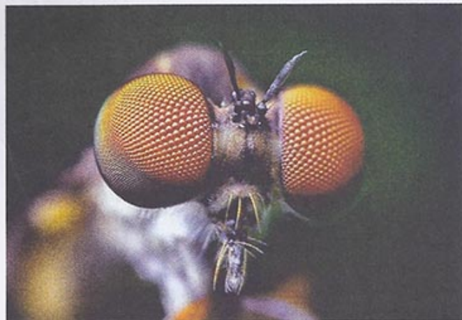
Close up of the eyes of a fly. It can be postulated that these small creatures are, at the experiential level, living more slowly, hence longer, relatively speaking, than homo sapiens.